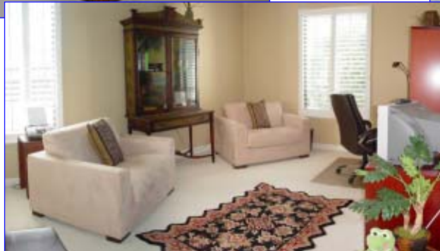
3-Bedrooms Master Bedroom Suite & Guest Bedroom Enjoy A Wonderful Pond & Golf Course View