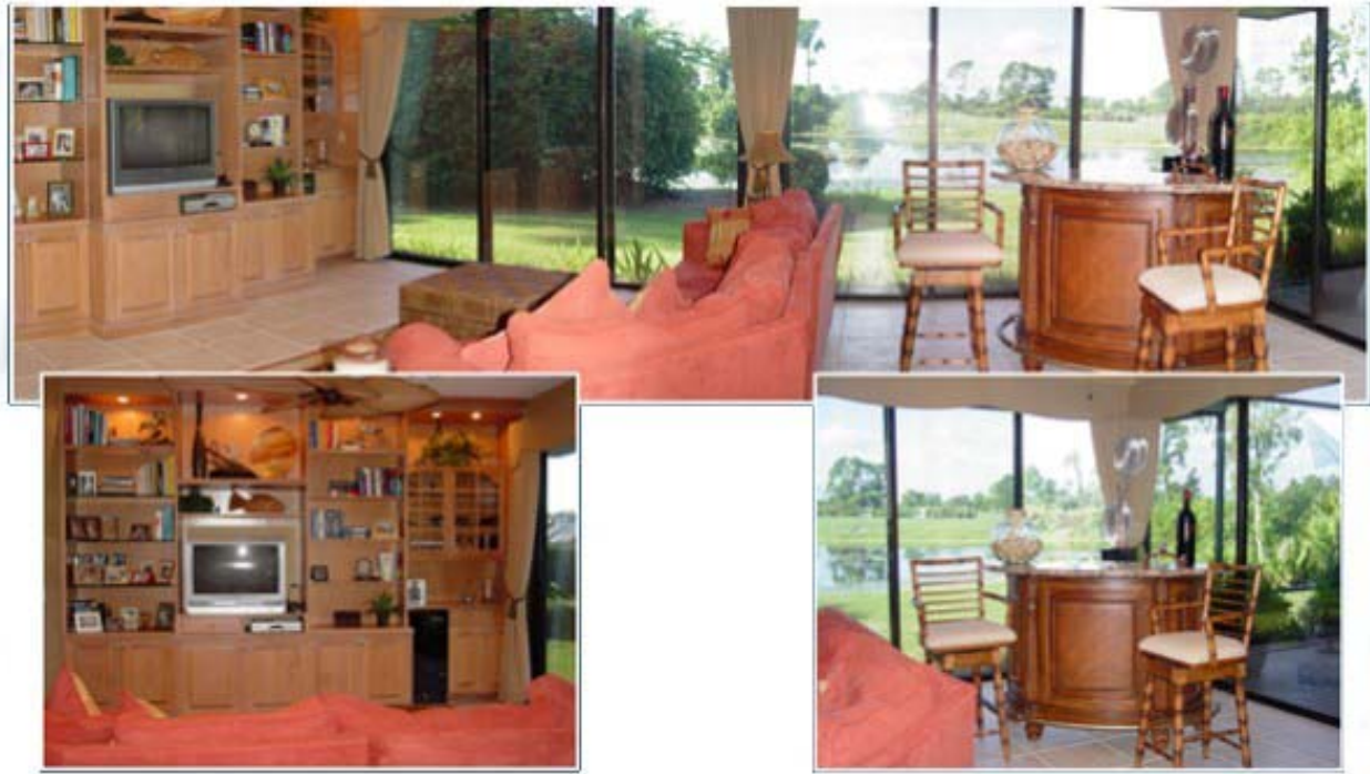
Florida Sun Room & Entertainment Center With A Wonderful Pond & Golf Course View