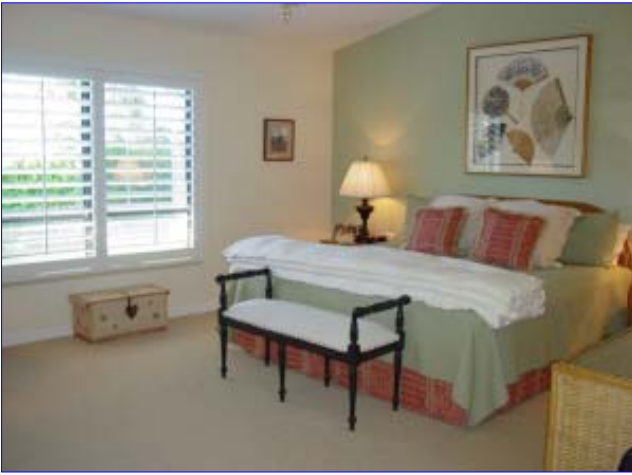
Master Bedroom Suite 17' x 15'