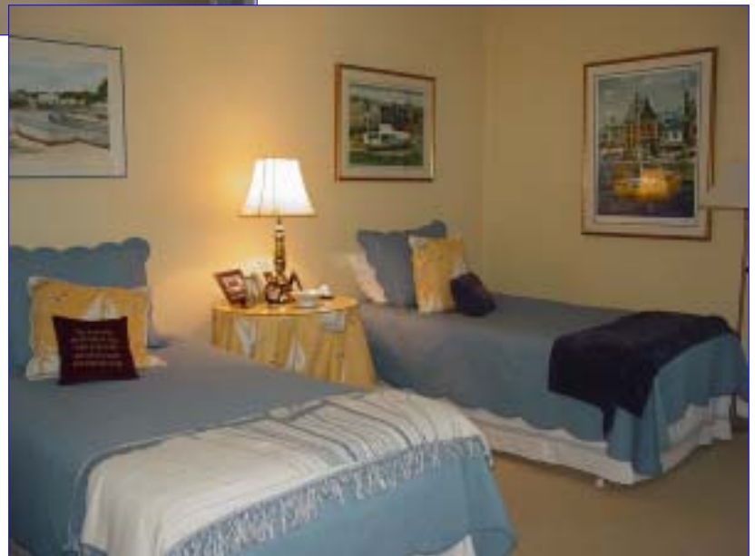
3rd Bedroom Suite 13' x 11'