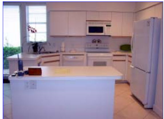
Wonderful Kitchen with Decorate White Appliances