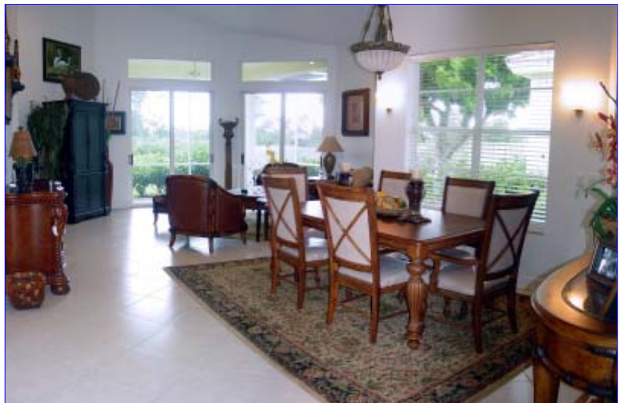
Fabulous Golf Course View