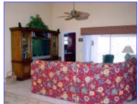
New 1/2 Bath