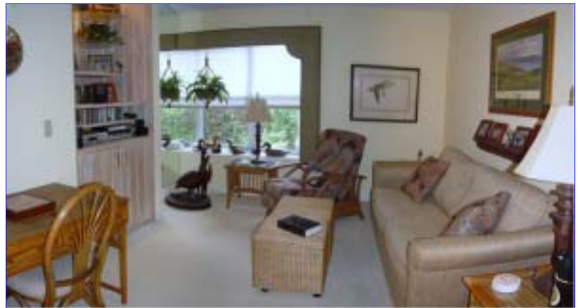
Den or 3rd Bedroom