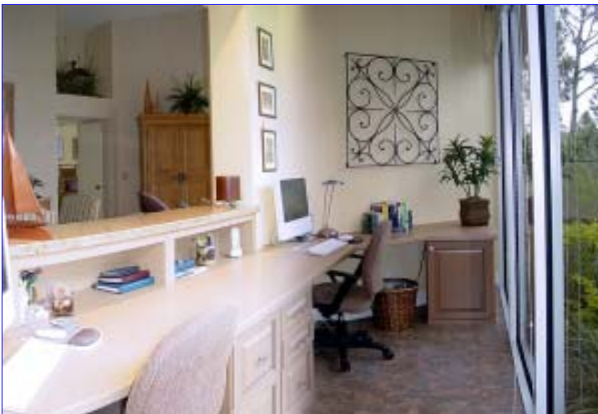
2 Station Office With Nature View