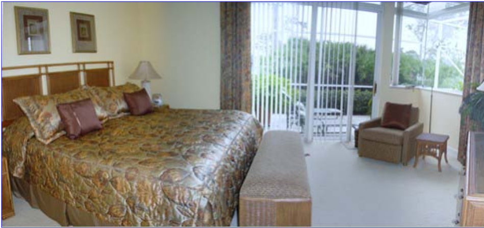
Master Bedroom Suite