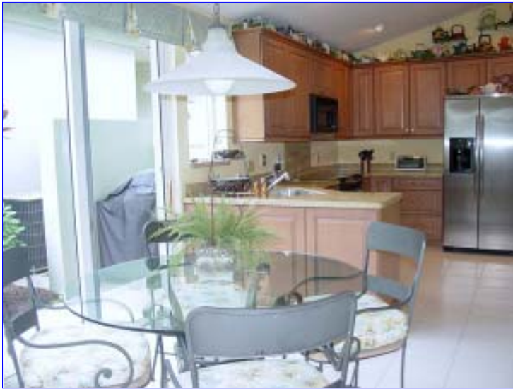
Kitchen: Stainless Appliances, Cabinets & Granite Counters